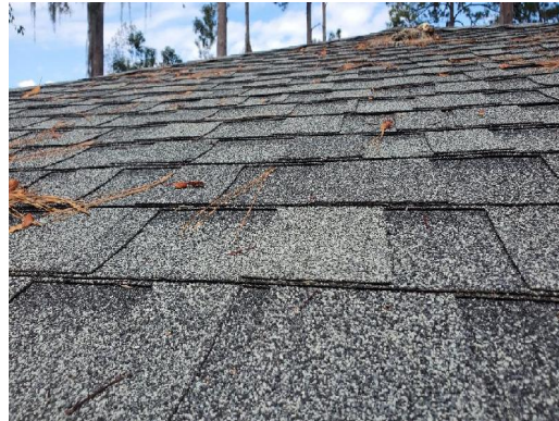
322-1 Asphalt Shingle/Black Tar/Black Typical Exterior Roof