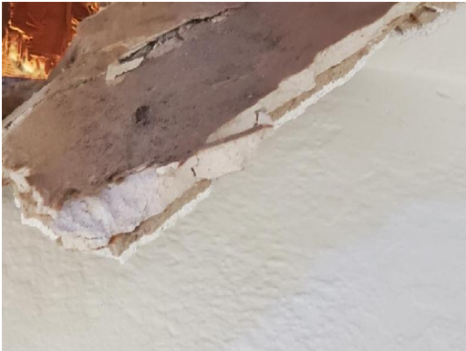
322-2 Drywall/Plaster Typical Interior Walls/Ceilings