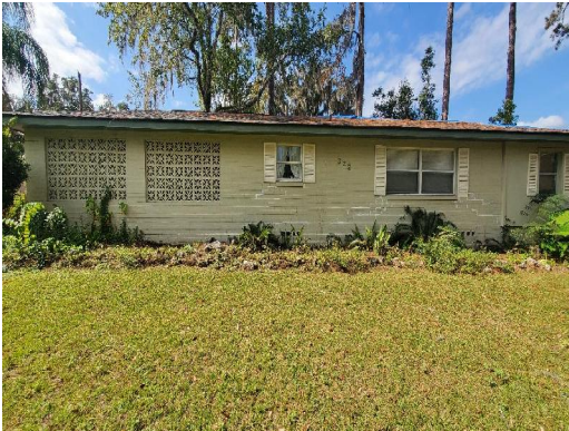
322 NE 12 th Avenue Ocala, FL 34470