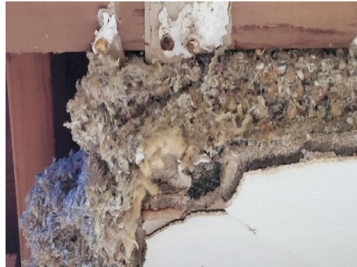
322-3 Insulation/Brown Typical Interior